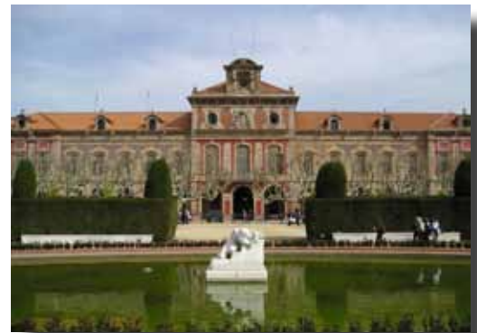
The Parliament of Catalonia

This summer, sixteen US Legislative Leaders, thirteen of their European, Canadian, and Asian counterparts, representatives of the US business community, and special guests convened in Barcelona for SLLF's 13th Annual Transatlantic Leadership Forum. Home of the extraordinary architecture of Antoni Gaudi, Barcelona is Europe's 6th largest city and an economic powerhouse for the region.